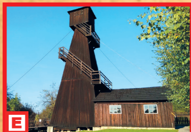
"Magdalena" Open-air museum of the oil industry in Gorlice