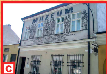
Regional Museum of PTTK in Gorlice