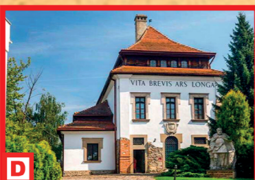
"Dwór Karwacjanów" Contemporary Art Gallery in Gorlice